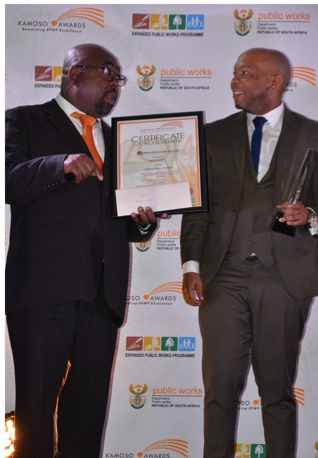
Minister of Public Works Mr TW Nxesi and Tshwane Executive Mayor Mr. K Ramokgopa at the prestigious EPWP Kamoso Award 2014 - St Georges, Pretoria.

Commenting after her Province's good performance at the