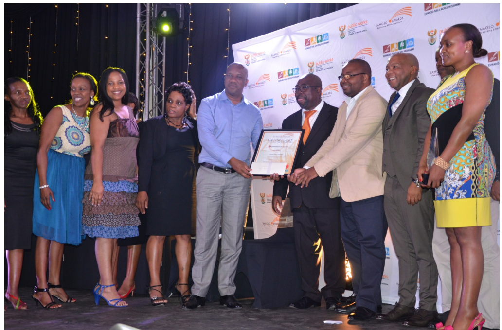
Project Awards winners of in the category in the Infrastructure and Social Sector; KwaZulu Natal

Below is the table of the Stars of the Prestigious 2014 EPWP Kamoso Awards,