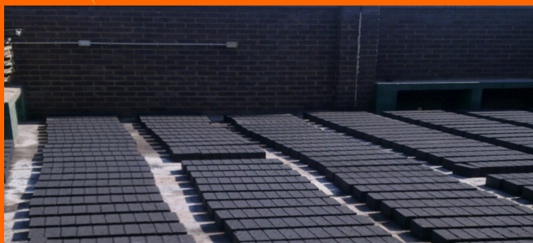
Brick making project at Agang Multi-purpose Centre