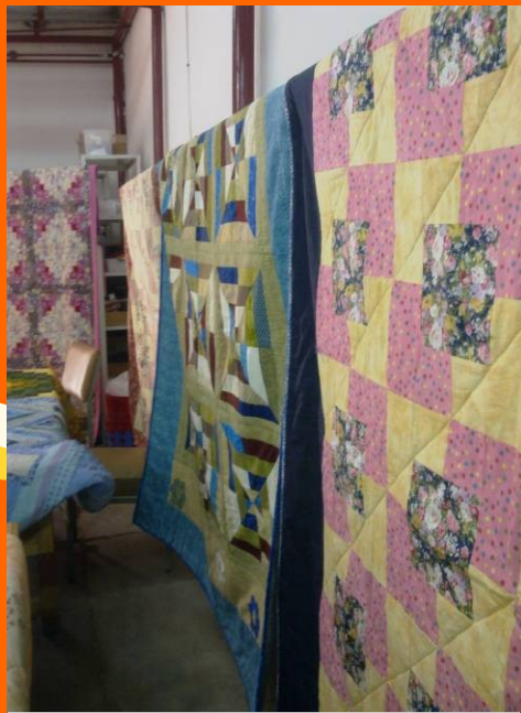
Quilts produced by Oasis Skills