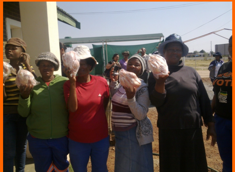
Poultry produce displayed by beneficiaries at Agang Multi-purpose Centre