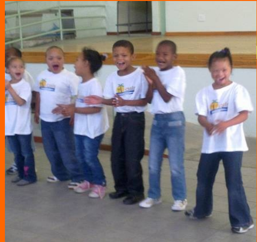
Oasis Centre learners performing for the Portfolio Committee