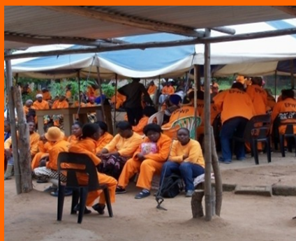
SA Active Disabled beneficiaries

The impact in the local communities is the project has employed woman, youth and disabled people from the street, it has decreased the number of crime that was growing from our community, teenage pregnancy from youth and unemployment by 60%. The subsidy has made a huge impact also because beneficiaries are able to put food on their tables.