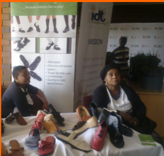
Ujimabakwena beneficiaries exhibiting shoes that they make at the women's economic workshop in Tshwane.