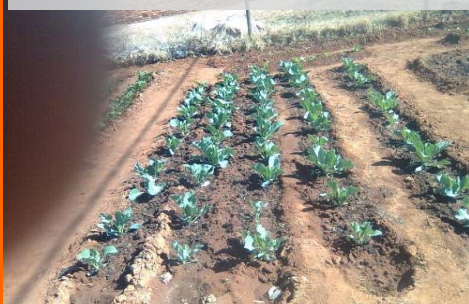
Barolong Bo Ratlou Ba Ga Seitshiro

The revenue generated from the sales of these produces is ploughed back into the projects to enable the expansion of the activities in order to employ more beneficiaries.