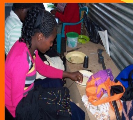
Beneficiaries at work