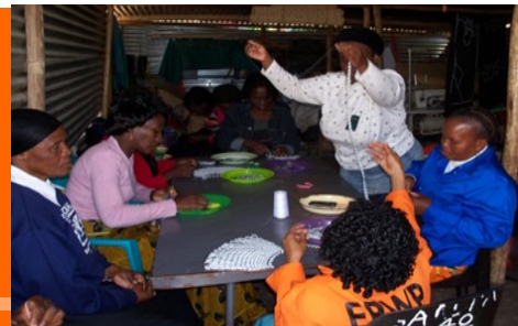
SA Active Disabled Beneficiaries

275 youth (50%), 301 Female (55%) and 200 (36%) people with disability.