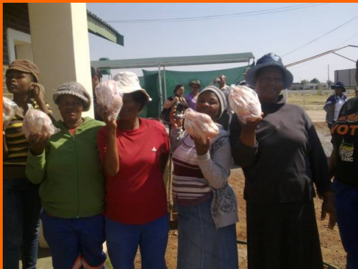
Agang Centre beneficiaries

On the 5 – 9 September 2011 the Department of Public Works (DPW) Portfolio Committee visited the Northern Cape. The Portfolio Committee was visiting the province as part of their oversight role of Public Works projects. The programme of the week included site visits of two Non State Sector projects in the province; Agang Multipurpose Centre on the 8 th September and Oasis Skills Development on the 9 th September.