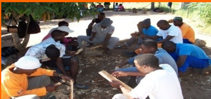
NSS Beneficiaries producing wood products in Mpumalanga