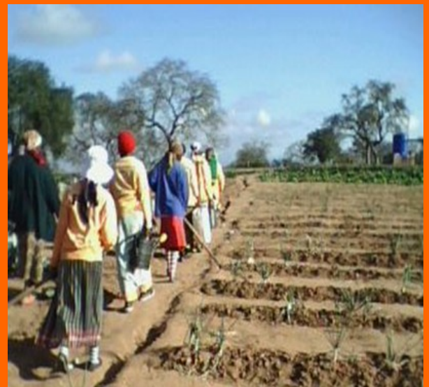
SA Active Disabled beneficiaries at work in the food garden.