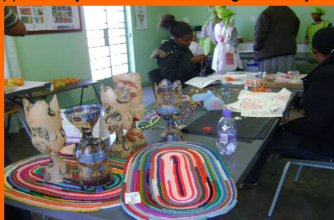
SA ACTIVE DISABLED ASSOCIATION

The findings of the evaluation study supported by the EPWP Web Based System (WBS) reveal that since the inception of the programme in 2009/10, more than 35 000 people across the country have been provided with an opportunity to work and to receive experience or skills from projects that are supported by the NSS NGOs wage subsidy.