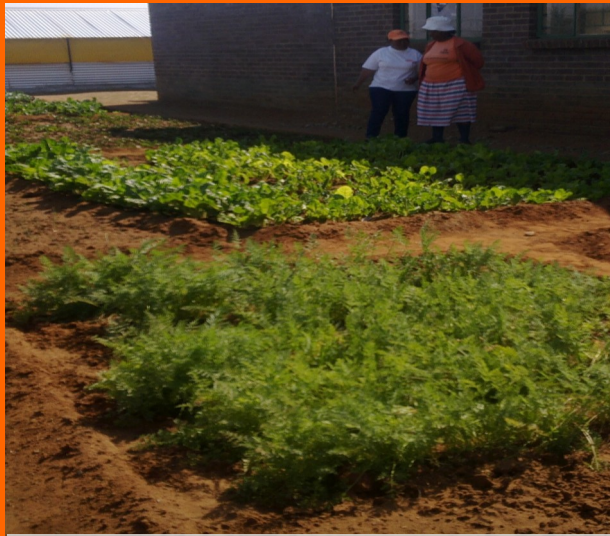
Agang Centre - food garden