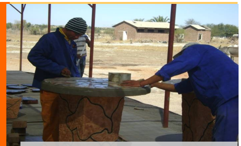
Beneficiaries at Oasis

Beneficiaries interviewed expressed how the programme has changed their lives; they mentioned that the NSS NGOs programme has afforded them with the opportunity of taking care of their families. One beneficiary mentioned that "because of EPWP NSS; I am able to walk into Shoprite and buy food for my family" . The programme has ignited a sense of responsibility and dignity to many people that have lost hope in life. One lady from an NPO in Mpumalanga stated "I now own a bank account and I am able to receive a notification message through my cell phone from the bank when my salary is paid."