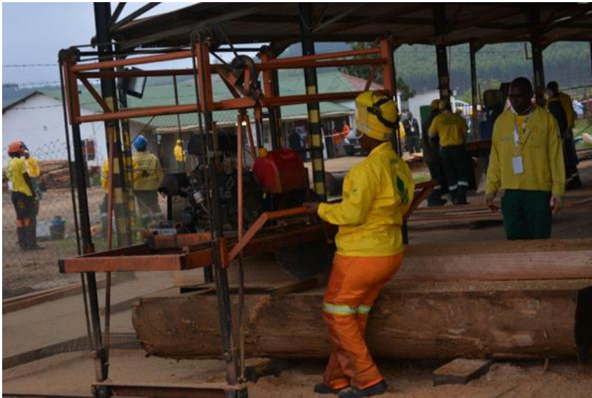
PEP-IMC Visit in Mpumalanga province